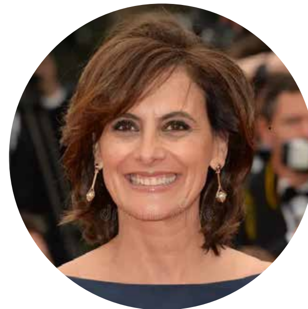
INES DE LA FRESSANGE